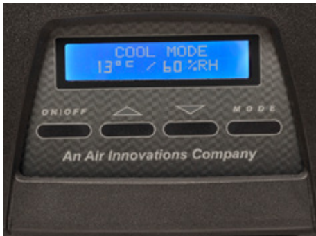
Front Digital Display