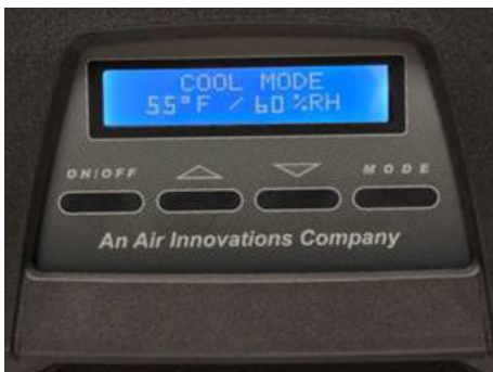
Front Digital Display