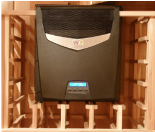
Front View in Racking