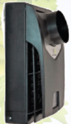
Back View With Optional Duct Adapter