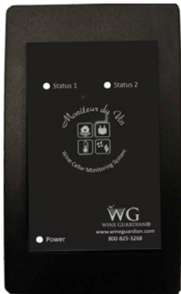
Moniteur Du Vin layout.