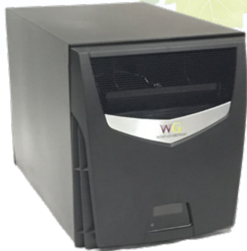
TTW unit out of racking