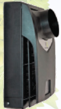
Back View With Optional Duct Adapter