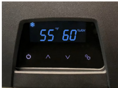
Front Digital Display