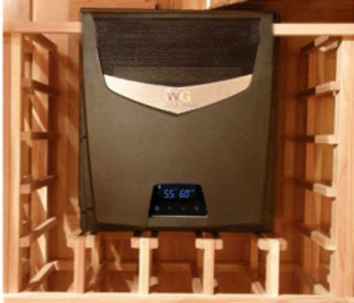
Front View in Racking