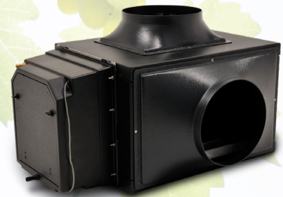
Ducted split system with optional, integrated humidifier