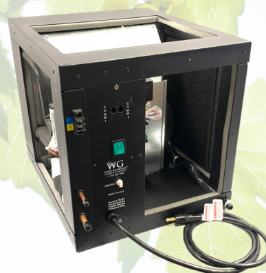
Removable cover panel for easy access