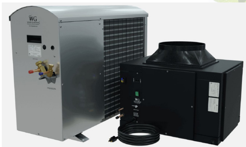
Wine Guardian condensing unit (L) and evaporator (R)